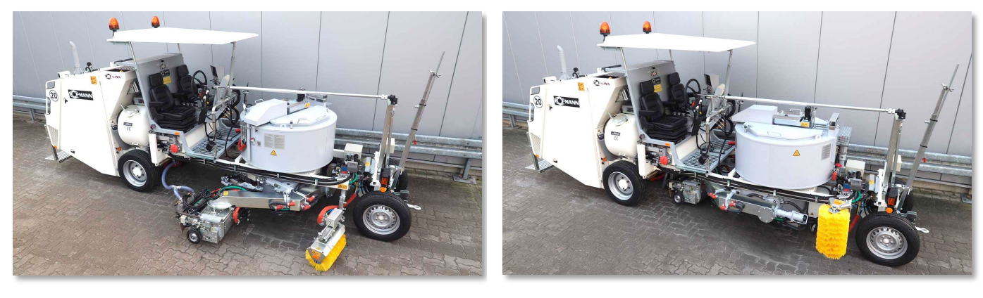
Marking position: Extruder on the side next to the container

The width of the machine during transport is only approx. 1,5 m.