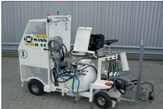
Easy maintainable H11-1: very good access ...