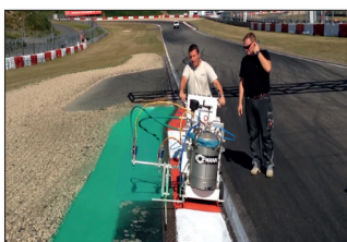
H9 Nürburgring in Nürburg, Germany