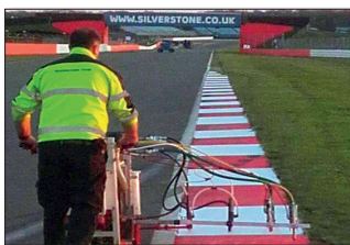
H9 Silverstone Circuit in Silverstone, UK