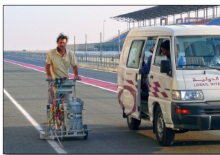
H5 Losail International Circuit in Doha, Qatar