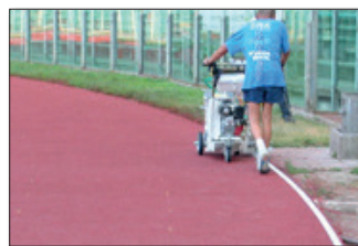
H5 Olympic stadium in Rome, Italy